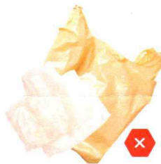
No Loose Plastic Bags, Recyclables in Plastic Bags, or Film Empty recyclables directly into your cart