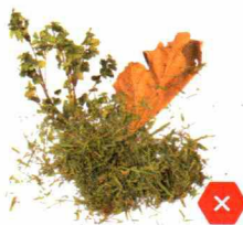
No Yard Waste