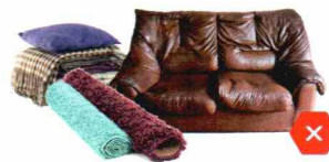
No Clothing, Furniture or Carpet