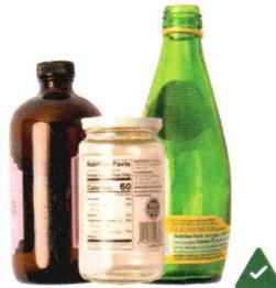
Glass Bottles & Containers