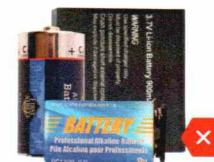
No Hazardous Waste or Batteries