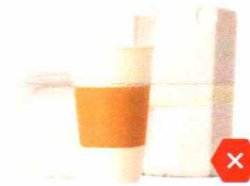
No Foam Cups & Containers